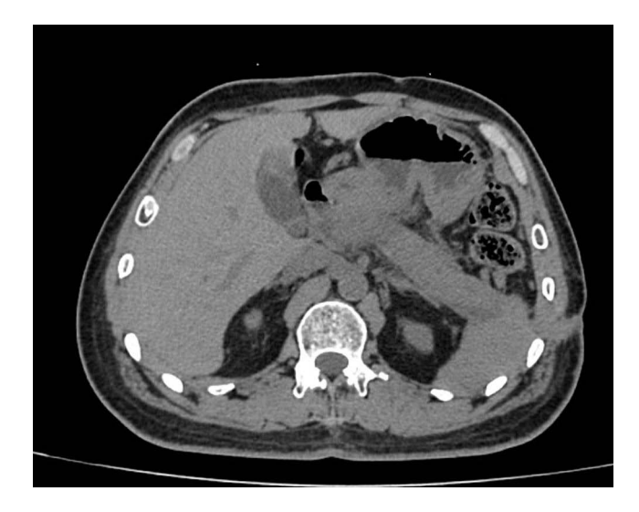
Figure 4 The CT scan shows a significant improvement in peripancreatic effusion, and the area of necrosis in the neck of the pancreas has noticeably decreased compared to before.

puncture was performed at week 4, and minimally invasive pancreatic necrosectomy was performed at week 7. On the morning of the third day after surgery, bright red blood with a volume of about 300mL appeared around the abdominal incision and drainage tube, and coffee-colored fluid flowed from the gastrointestinal decompression tube of the patient. On the second day after bleeding, the patient's stool was black, and the fecal occult blood test was positive. Subsequently, the patient underwent digital subtraction angiography (DSA) to identify the source of bleeding, but no identifiable arterial bleeding was observed. The hemorrhage ceased following interventions including gauze compression, administration of hemocoagulase and norepinephrine saline through the drainage tube, infusion of omeprazole, and blood transfusion. We considered bleeding from a rupture of a certain splanchnic vein, but unfortunately we did not have definitive evidence. Following CT-guided abdominal puncture drainage, minimally invasive pancreatic necrosectomy, and other surgical interventions, along with conventional anti-infective measures and nutritional support, the patient's condition improved and was discharged. Subsequent CT examination conducted six months later revealed a significant amelioration in peripancreatic exudation and complete resolution of necrotic tissue in the pancreatic neck (Figure 4).