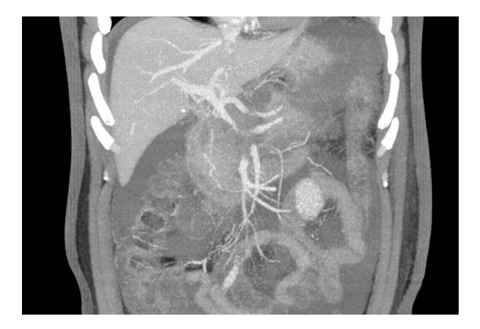
Figure 2 The abdominal enhanced CT results indicate the presence of venous thrombosis in the splenic vein, portal vein, and superior mesenteric vein.