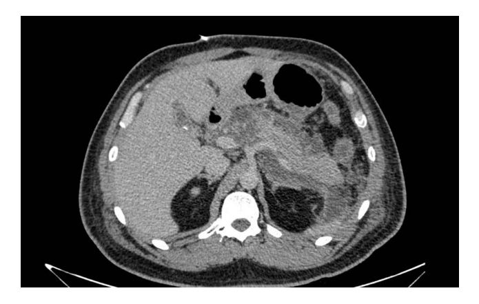
Figure I The CT showed diffuse edema of the pancreas, accompanied by peripancreatic fluid collection and gallstones.